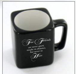
The Friendship Mug: "True Friends are never apart, maybe in distance but never in Heart."