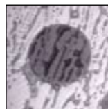
Left: Fingerprint oils on a terminus end-face. Right: A properly cleaned connector terminus