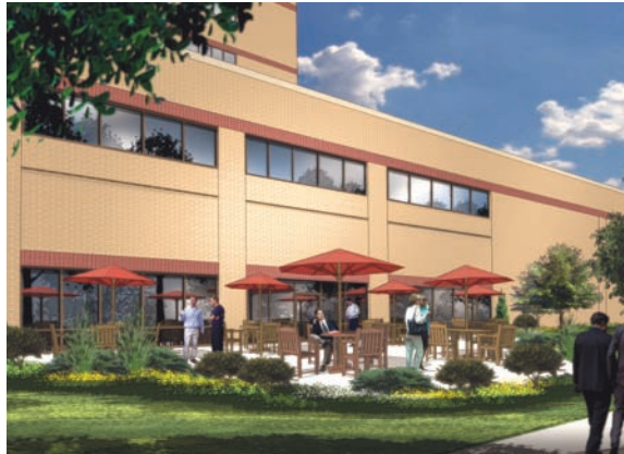
Pavers to be engraved onsite in the Reflection Terrace adjacent to the Cafeteria.

in memory or honor of someone, or as an opportunity to leave a personalized message.