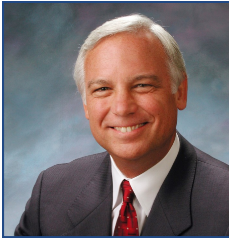
Author, Jack Canfield

Wednesday, September 8, 2010 1:00 p.m. - 2:00 p.m.