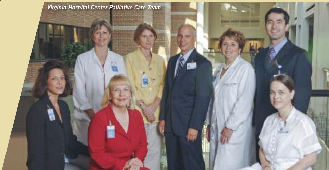
Virginia Hospital Center Palliative Care Team.

As the first hospital-based palliative care program in Northern Virginia, our team is devoted to relieving suffering and improving quality of life for patients with severe illnesses and their families. Insurance does not cover the cost of providing many valuable support services, so charitable giving is needed to help maintain and expand the Palliative Care Service at Virginia Hospital Center.